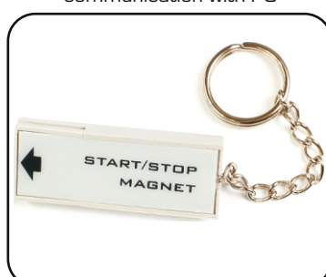
LP004 - start/stop magnet