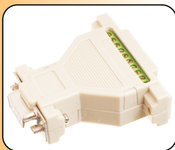
Adapter for input signals connection