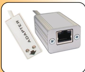
LP005 - LAN adapter