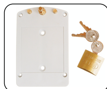
F9000 - wall holder with lock